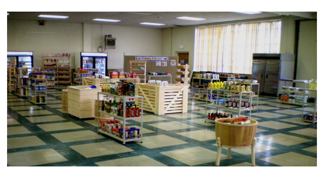
The TCAP Food Co-op Grocery Store

Cash, checks, and food stamps are accepted. The store is open Monday through Friday from 9 a.m.- 4 p.m. and closed on holidays.