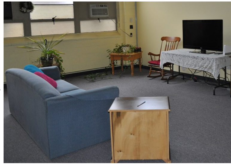
TCAP'S Senior Center

TCAP staff members and volunteers gather once a month to prepare and serve a free lunch. Senior citizens ages 55 and over are invited to the TCAP cafeteria to enjoy great food and good times. All lunches include a salad and dessert. After the lunch is completed, seniors enjoy 10 games of bingo. The Senior Luncheon is sponsored by the Community Services Block Grant. Free transportation is offered by C.A.T.S. (see page 16). The Senior Center is open Monday-Friday, 10 a.m.-3 p. m.