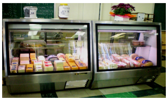
{\it The Food Co-op's Meat and Cheese \ display}.