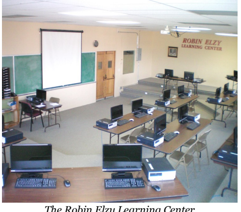
The Robin Elzy Learning Center

The RISE or Reaching Individual Skills and Educational (Goals) program works in conjunction with the Head Start program to help parents of Head Start students earn their GED while their child attends class. Classes are available Monday through Thursday from 8:30 - 11:30 a.m. Head Start parents needing transportation can ride the bus to the RISE program with prior arrangements. Enrolled adults can learn the fundamental courses needed to pass the GED test, and also receive adult basic literacy education programming.