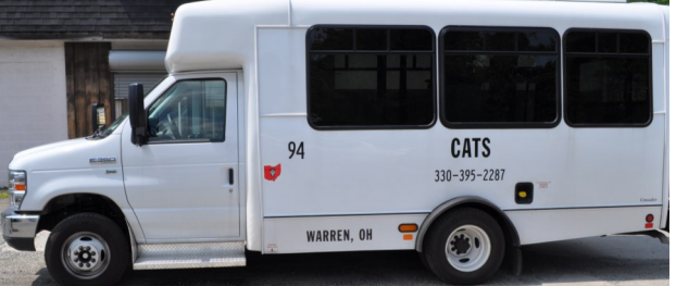
C.A.T.S. Transportation Vehicles

CA.T.S. is contracted to provide transportation for the following agencies: Trumbull County Department of Jobs and Family